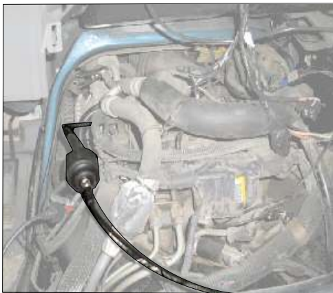
Note Simple Hookup to Engine

FirstLook™ vacuum waveforms showing the effect of a worn cam and lifter in a Safari van