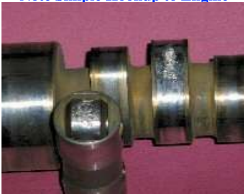
Photo of parts replaced showing cam and roller damage.