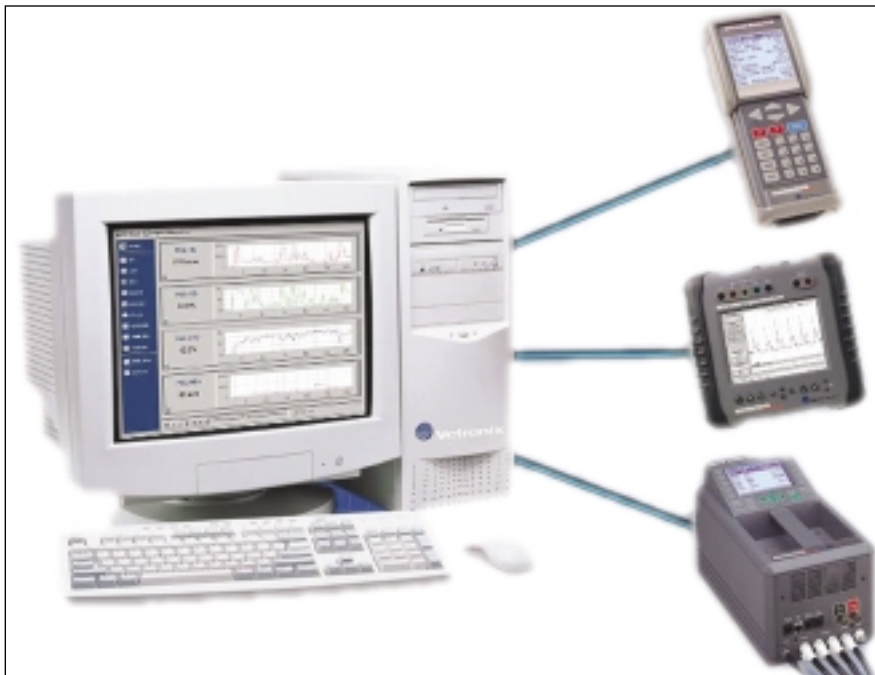
Vetronix TechView Pro

ALLDATA and an online technical support hotline.