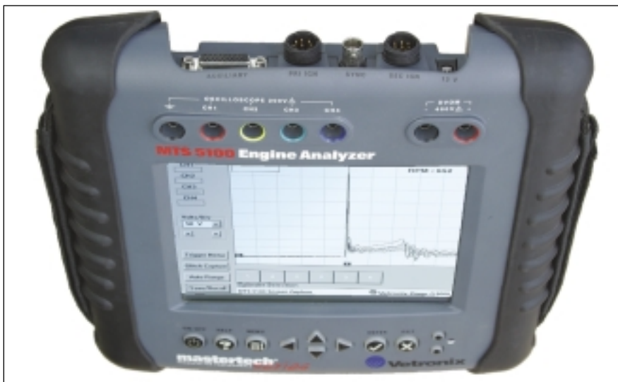
Vetronix MTS 5100

Other features include a "save on trigger" that helps automate waveform captures based on signal. You can also install the software on as many machines you want. After that, simply connect the PicoScope hardware to get going. The PicoScope is also ideal for training. It has highly adjustable controls that allow you to maximize the waveform display, and