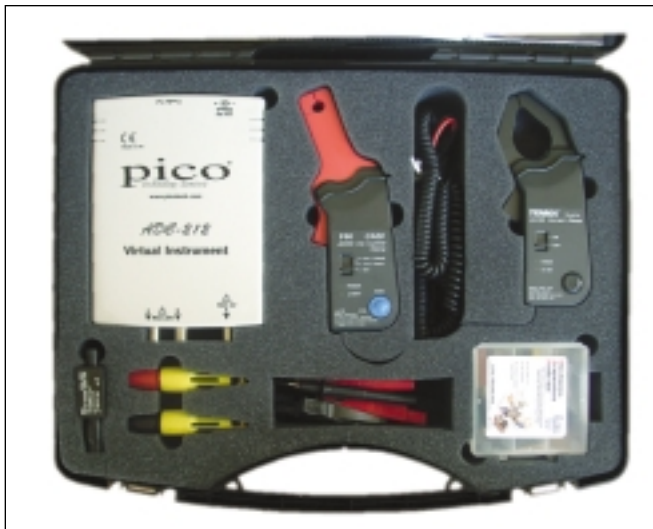
Pico Technology PicoScope

•On every job you learn something; the hope is you won't have to learn it