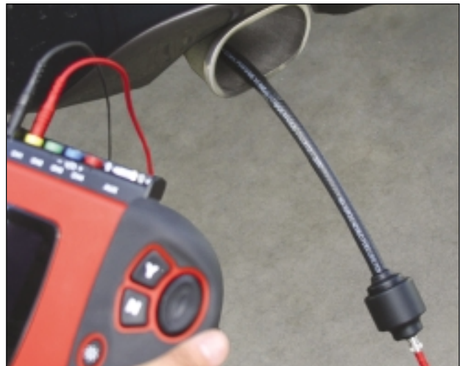
SenX Technology FirstLook Engine Diagnostic Sensor