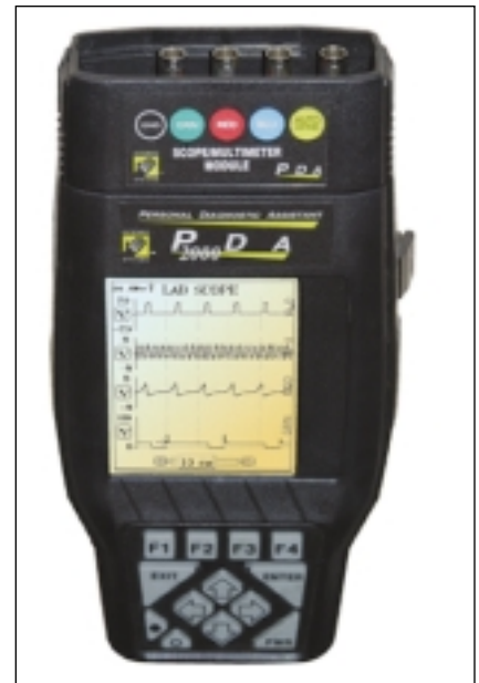
Omitec Interro PDA